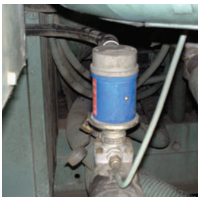
Regular checks to expansion settings ensures optimum energy efficiency.

It is more important than ever that you can be confident you are optimising the serviceable life of all your capital equipment including the air conditioning systems. A major Bank and Investment Company based in the city were faced with ageing chillers regularly breaking down and called in Accent Services to investigate.